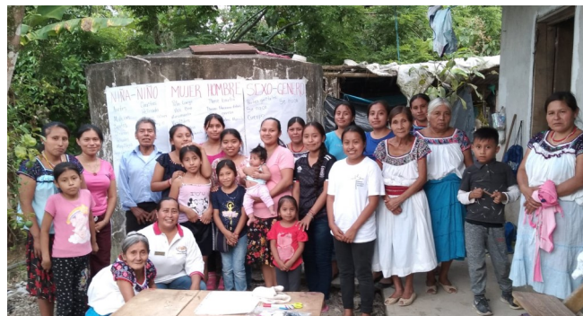
Xalcuahuta Puebla - Nahuatl Group