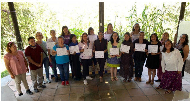
September Basic Health Course